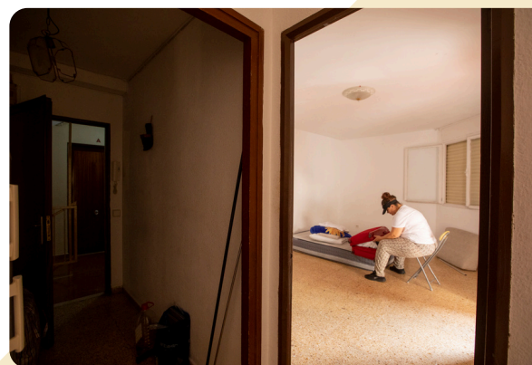
Desnonament (2022) , Josep Lluís Sellart.

From the Camp de Tarragona Photojournalism Award