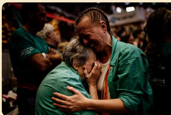
Llàgrimes de castellera veterana (2024) , de Laia Solanellas.